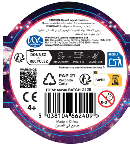
EXHIBIT # 6