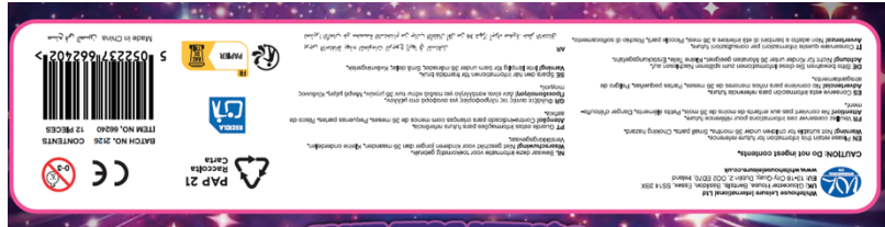
EXHIBIT # 8