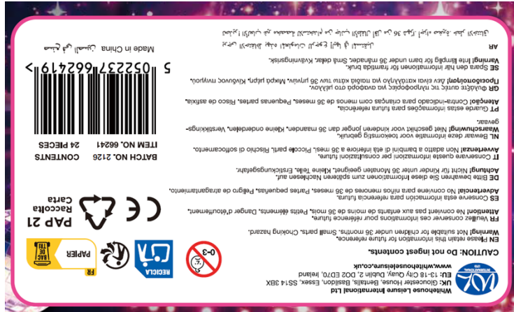
EXHIBIT # 11