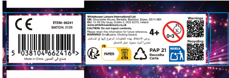
EXHIBIT # 10