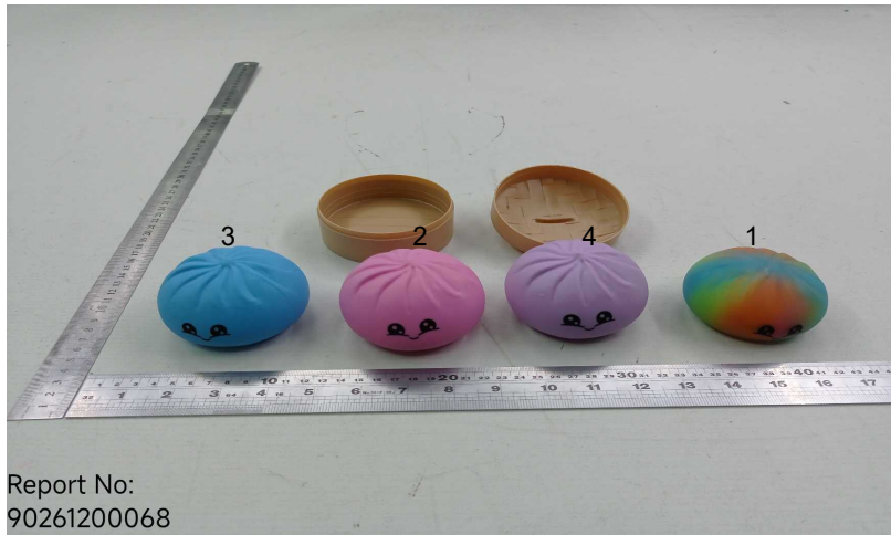
EXHIBIT # 2